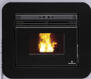
NEVA + M-94

Puerta en cristal vitrocerámico serigrafiado color negro. Screen-printed black glass door. Porta de vidro vitrocerámico serigrafada cor preta. Porta in vetro ceramico serigrafato nero. Porte en vitre vitrocéramique sérigraphiée noir.