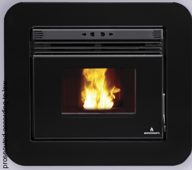
NEVA + M-94

Puerta en cristal vitrocerámico serigrafiado color negro. Screen-printed black glass door. Porta de vidro vitrocerámico serigrafada cor preta. Porta in vetro ceramico serigrafato nero. Porte en vitre vitrocéramique sérigraphiée noir.